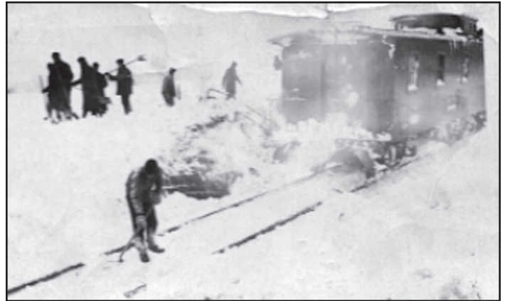
This was a snapshot of that tragic day. Paddock's Crossing is on Stone Road, between Wilson Street and the New 104.