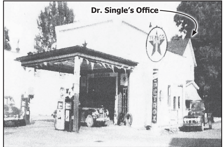
The Texaco Station