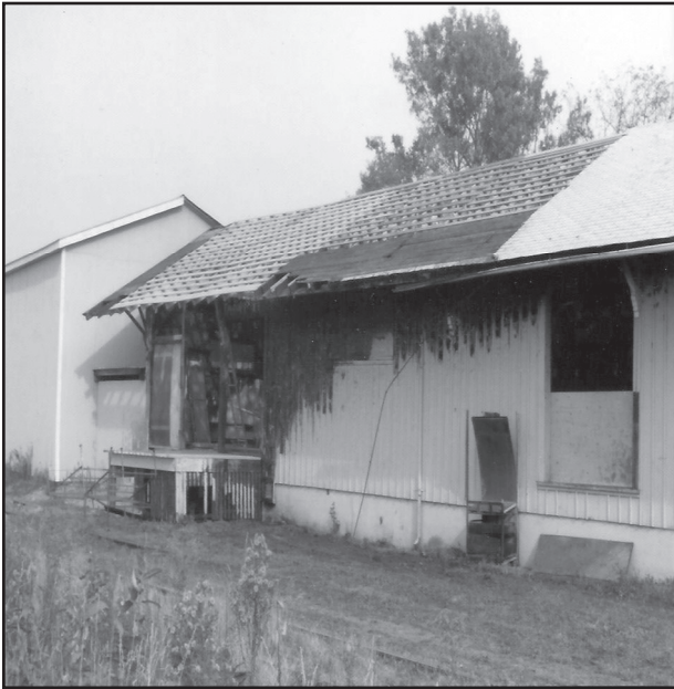
This picture shows the repairs and painting the building after the fire.

Children set fire to the station in October of 1976. The part where the passengers would have waited and also where the station master was, had smoke damage. However, where the baggage & freight were kept, the room was fire damaged. In this room the old Way-Bills were stored and I believe that storage was in the rafters. Many were partially burned, but still readable.