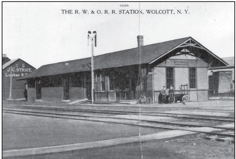
Circa early 1900s. Two railroad station men waiting for the train to arrive? One looks to be the station master (on left).