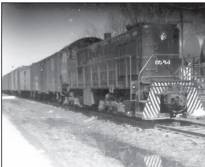
In 1955 the New York Central freight train looked like this.