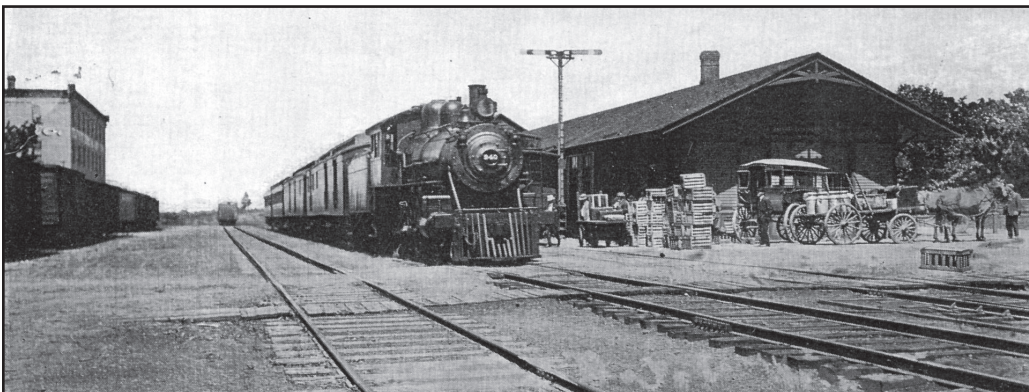
Passenger coaches, last 2 cars, & a coach is waiting on the right. Freight train either being loaded or unloaded. Circa early 1900s.

Watertown & Ogdensburg Railroad (R.W.&O), which now made it possible to run freight to the Atlantic ocean via rail.