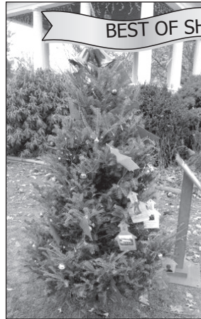
North Wolcott School Historical Society