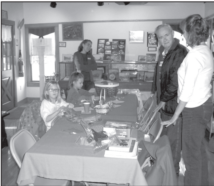
Christmas open house at the museum

Again this year we will be having a yard sale at the Carriage House, Donations will be accepted at the museum during open hours. Watch for the date of this event at a later date