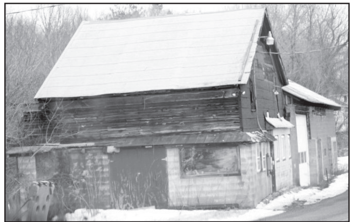
Yancey's cider mill in Huron, NY