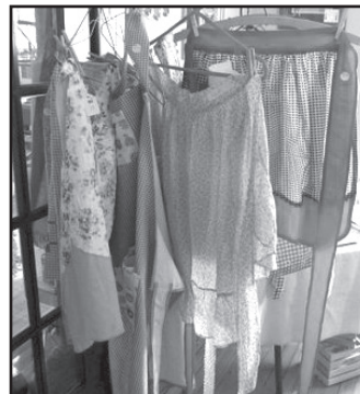
Aprons in the Gift Shop