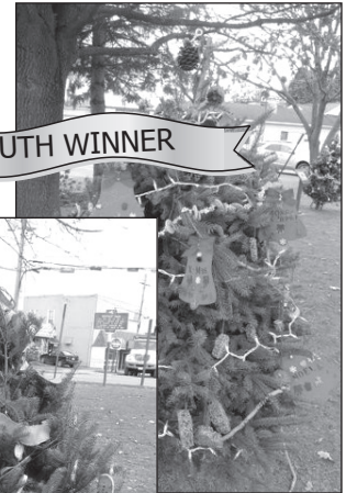
NR-W Girl Scouts