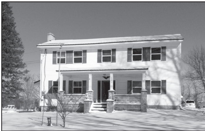
The House on February 14, 2016