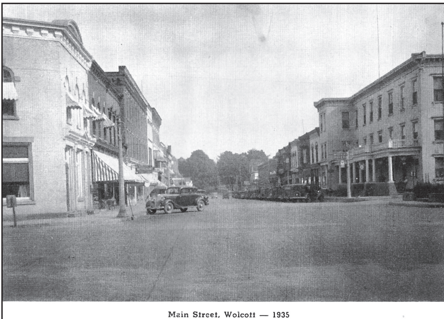
Main Street, Wolcott — 1935

Our next newsletter will be about the railroad here in Wolcott; memories and pictures would be appreciated. We can make copies of pictures. Museum is open Saturdays 10-2 pm.