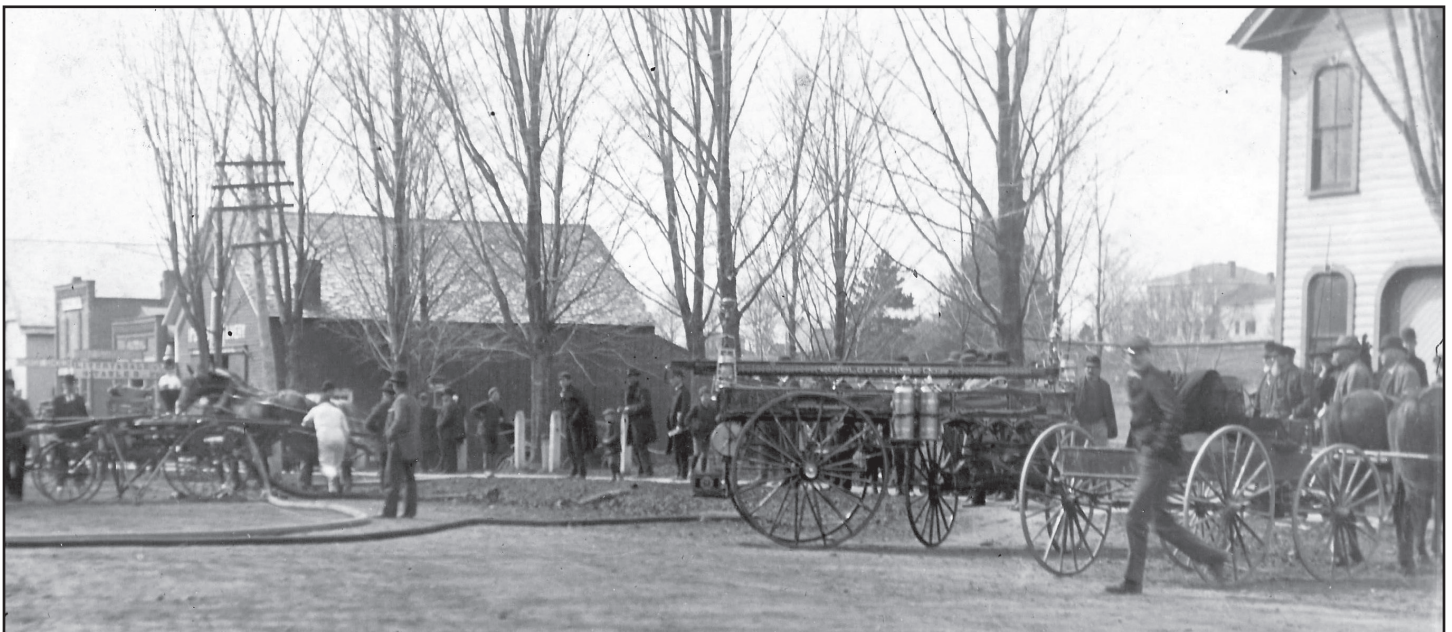
Early Firefighting Apparatus on New Hartford Street Circa 1910

At 3 a.m. on October 8, 1978, the Wolcott Fire Company responded to the call and the home was saved, but much damage sustained. Everyone was safely evacuated from the home, Chuck, Renee and 2 small children. Chuck & Renee gutted the damaged parts and put the home in livable condition. They continue to maintain and improve the home and property.