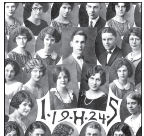
At High School Graduation. As president, he is in the center.