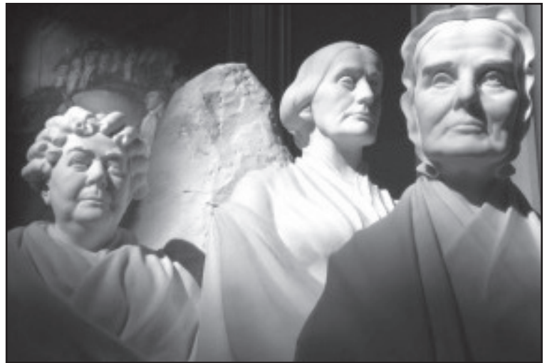
Elizabeth Cady Stanton, Susan B. Anthony, and Lucretia Mott

To raise public awareness, these ladies, plus many more, formed organizations who lobbied the government to grant the voting rights to women. After a 70-year battle, the 19th Amendment was passed.