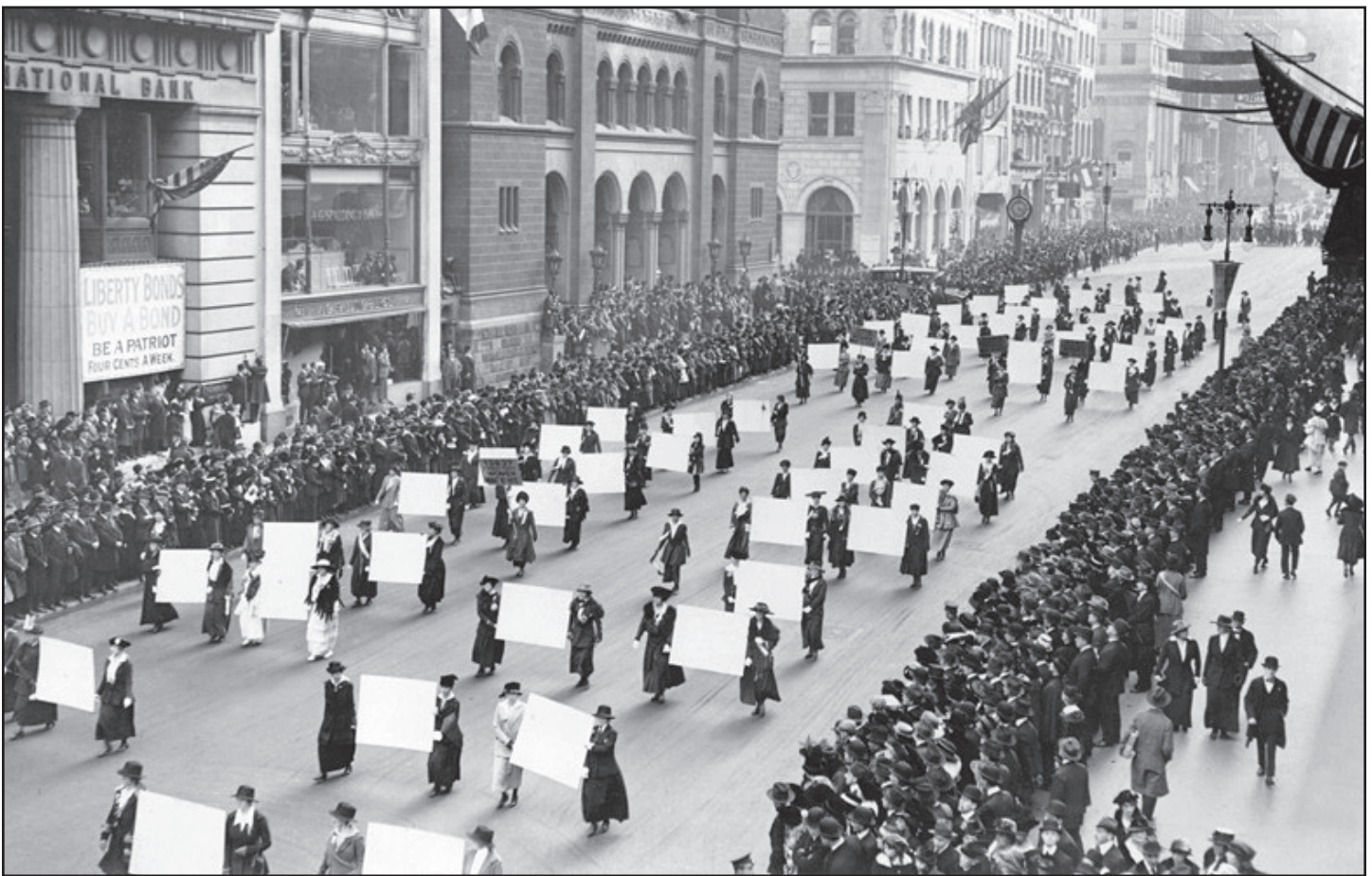
This is a picture of the women suffragists parading in New York City, 1917, carrying signs with signatures of more than a million women demanding the right to vote.

O n August 18, 1920, the 19th Amendment to the Constitution granted American women the right to vote. This right and the movement to achieve this right was known as woman suffrage.