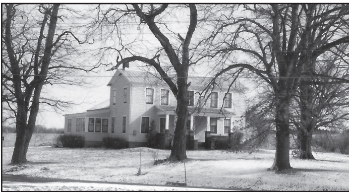
The Perfect House

Their love for antiques continues. They no longer travel and only set up as vendors a couple of times a year. They are involved in the Ontario Mall Antique group, both in Farmington and Irondequoit. It's a constant learning business. That's why they enjoy learning about Wolcott, its people and history through the Historical Society. They feel it is a privilege to serve as board members.