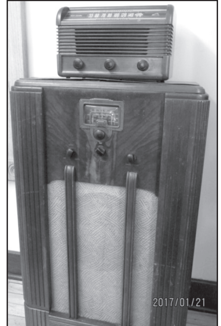
Remember (before every home had a TV) sitting in front of a radio listening to your favorite program? Donated by Jack & Phyllis Rosecrans' by a neighbor next to their home.

A photo album of the Palace Theatre, complete with the placards of what movies were playing for the month. The theatre was open to show 3 different movies in each week. Come in and take a walk down memory lane!