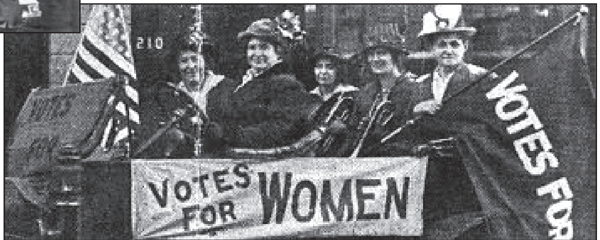
Women in a parade to raise awareness that women should have the right to vote.

If anyone has information on women who were active in this movement in Wolcott, would you share it, so that could become part of our archives?