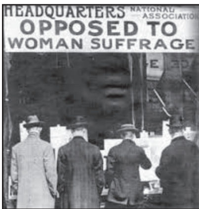
As you can see in the picture, men formed an association to oppose the women's right to vote. However, many a man stood behind his wife and supported her.